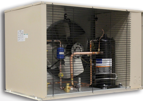
G-Series 1/2 - 6 HP Condensing Unit